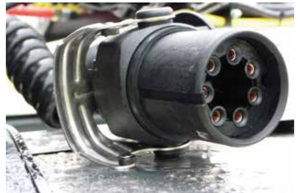
ISO 7638 ABS/EBS connector

Trucks first used on or after 1 May 2002 must be fitted with ISO 7638 connections. If a truck is fitted with an Electronic Braking System (EBS) and is towing a trailer fitted with EBS then a 7 core cable must be used.