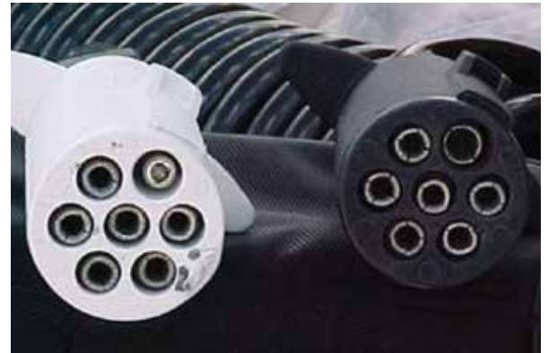
24N and 24S connectors