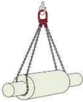
Choke lift single leg