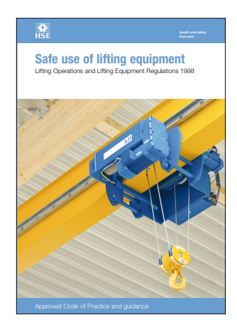
L113 (Second edition) Published 2014

This Approved Code of Practice and guidance is for those that work with any lifting equipment provided at work or for the use of people at work, those who employ such people, those that represent them and those who act as a competent person in the examination of lifting equipment.